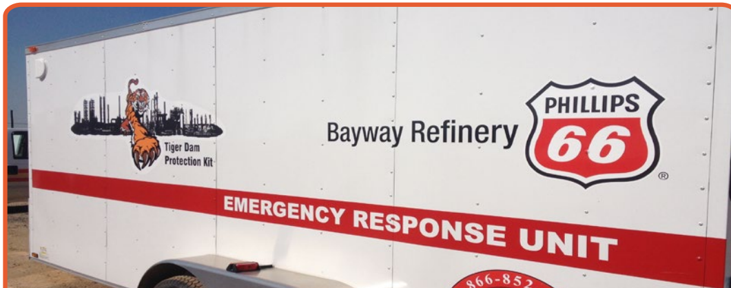
S.E.R.T. (Standard Emergency Response Trailer) 7' x 20'

Emergency Response Trailers 18"/24"/36"/42" Tiger Dams™ Fully equipped for Rapid Mobility Deployment