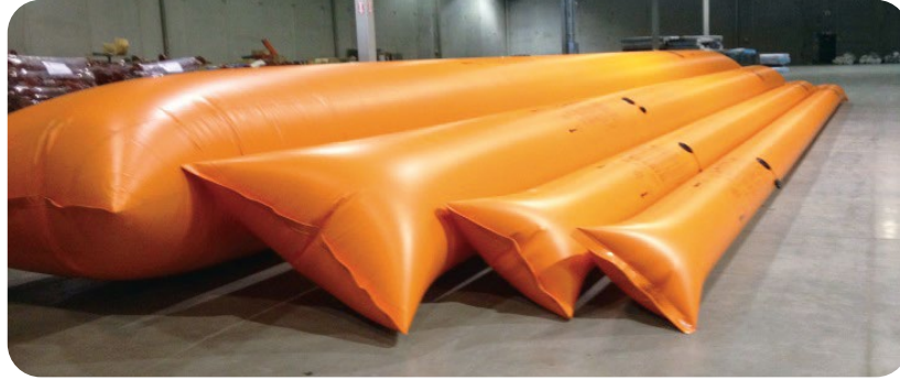
18" TIGER DAM™